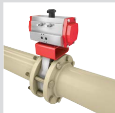
High performance double offset butterfly valve (> 2 BSPT)