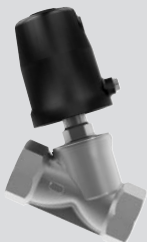
Angle seated single acting valve (up to 2 BSPT)