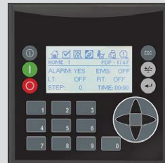
Intuitive system controller with backlit display