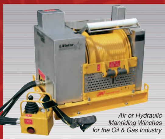
Air or Hydraulic Manriding Winches for the Oil & Gas Industry