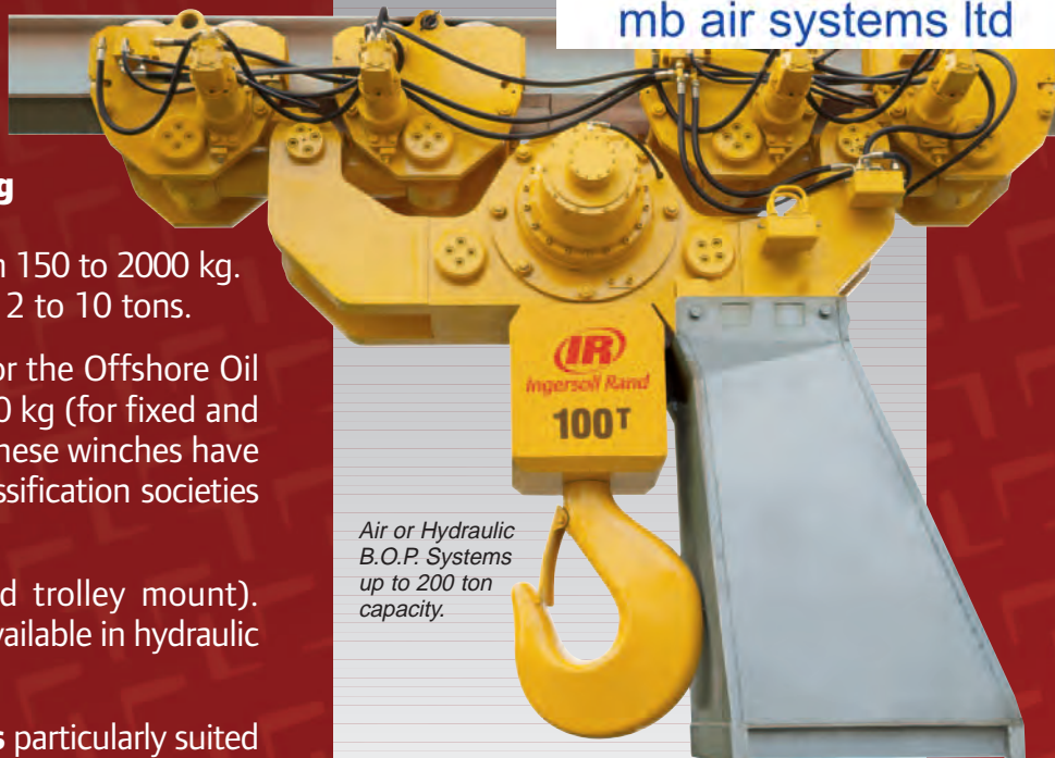
Air or Hydraulic B.O.P. Systems up to 200 ton capacity.

2724 Sixth Avenue South Seattle, WA 98124 – USA Tel: + 1 206 624 0466 Fax: + 1 206 624 6265 or 1 206 447 0715 E-mail: fasteam@irco.com