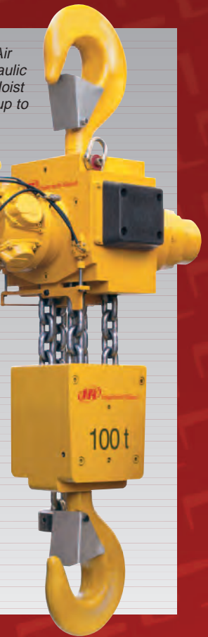
Heavy Air or Hydraulic Chain Hoist Range up to 100 ton capacity