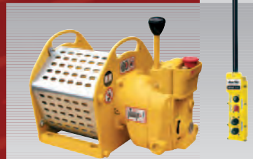
Portable Air Winches from 0.15 to 2.4 ton capacity