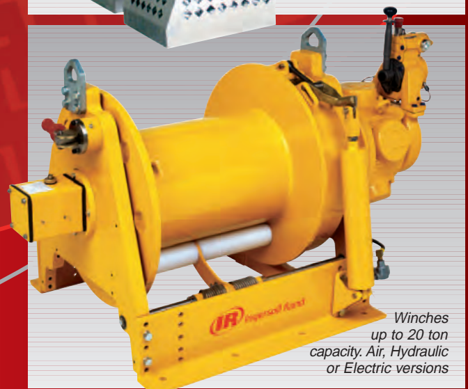
Winches up to 20 ton capacity. Air, Hydraulic or Electric versions