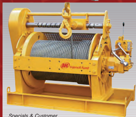
Specials & Customer Applications on request : e.g. Utility Hydraulic Winch for Offshore Platform.