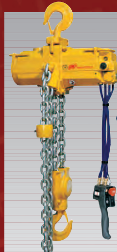
Air or Hydraulic Chain Hoist Range up to 12 ton capacity

The air winches are suitable for Zone 1 and 2. They are classified "Ex II 2 GDcIIB135° C".